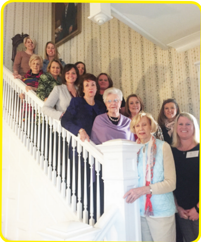
2017 Board of Governors Meeting

I would like to thank each and every member for all your volunteer hours and dedication. I would also like to thank each Sustainer for your continued support. Now I will officially change my status from active to sustainer and will look forward to watching the Ladies in Pink shine in the hearts of the children in Martinsville and Henry County.