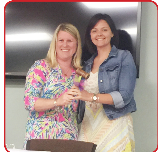
Pass the Gavel