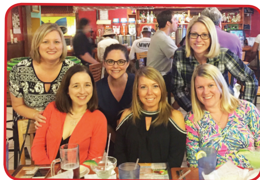
Our Graduating Seniors!