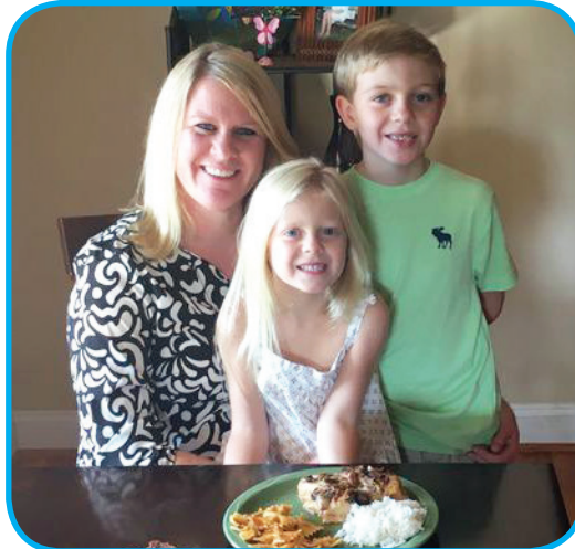
Cook of the Week