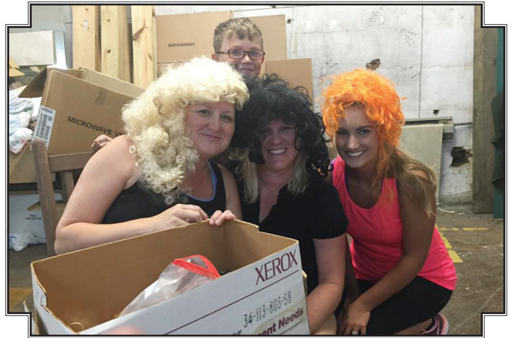
Marking Party Fun!