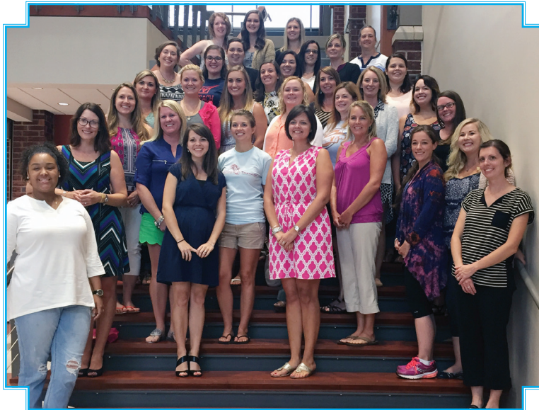
Wine and Cheese Social at NCI