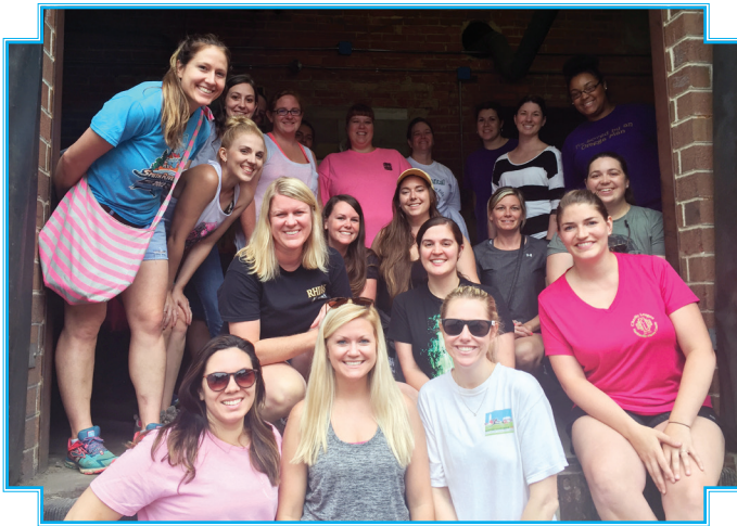
First Marking Party of the Summer