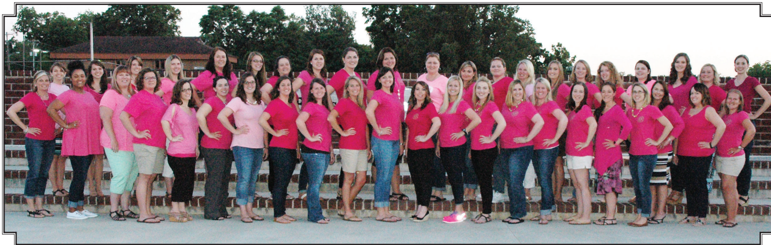
The active and provisional class for 2016-2017